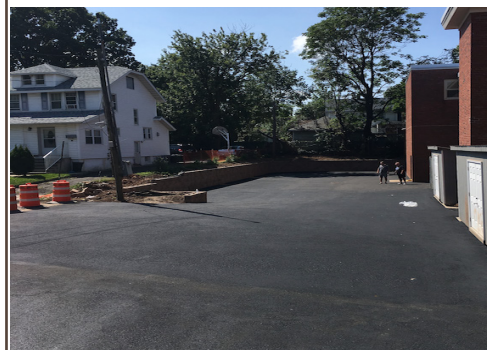
Almost completed - back paving project at HS